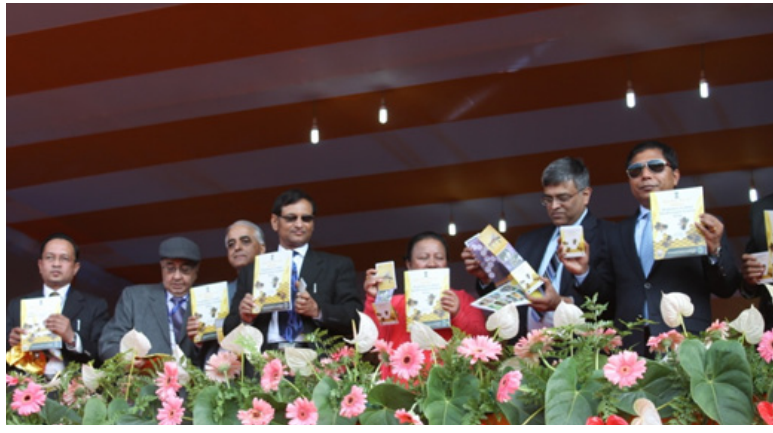
Hon'ble Chief Minister, Dr. Mukul Sangma unveiling the Beekeeping Resource manual