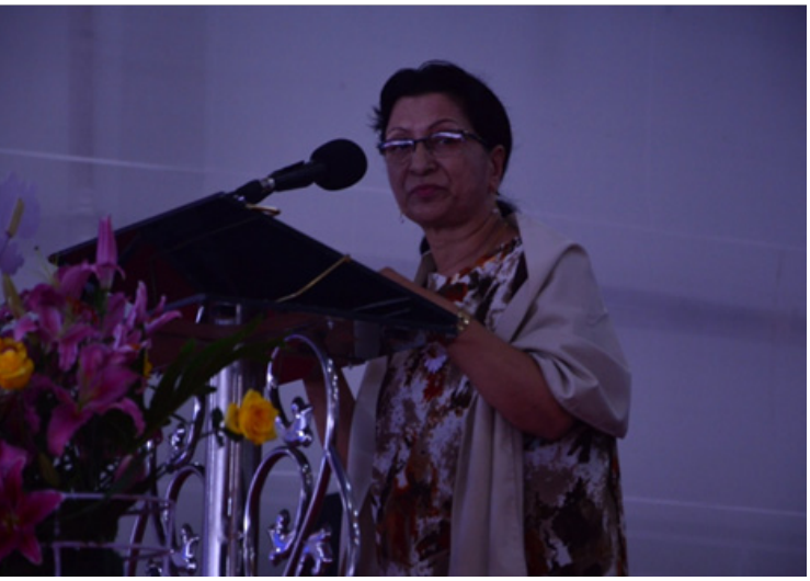
Home Minister Smt. Roshan Warjiri addressing the guests