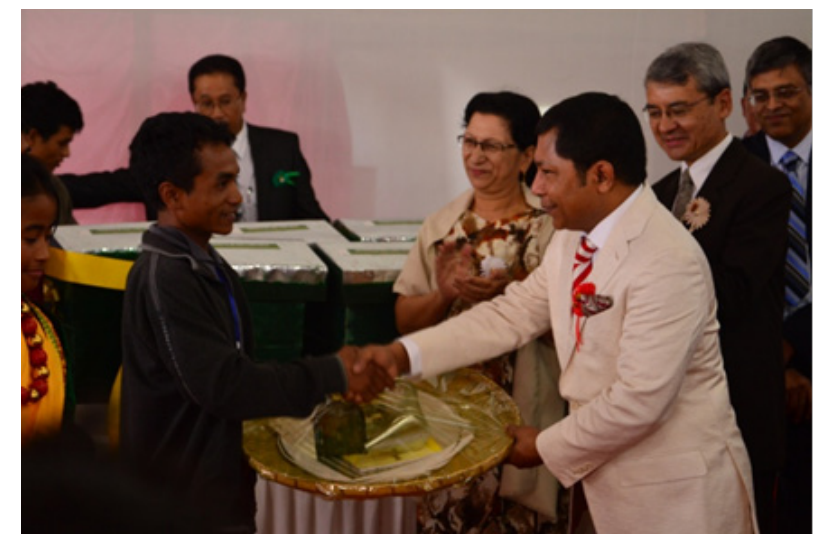
Hon'ble Chief Minister Dr. Mukul Sangma felicitates a Master Beekeeper