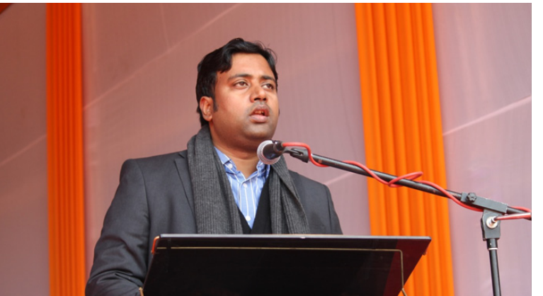
Welcome address by Shri. P.Bakshi (IAS), Deputy Commissioner, West Garo Hills