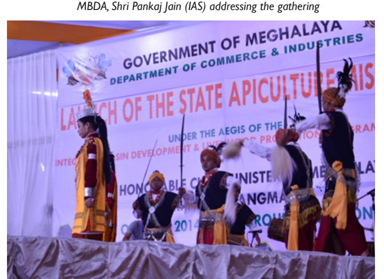
Cultural programme during the launch of the Apiculture Mission